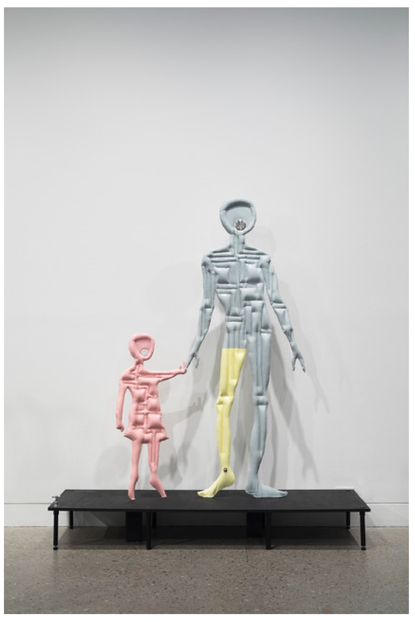
Mother and child 2019, canvas, gypsum cement, aluminium, steel, paint, epoxy glass