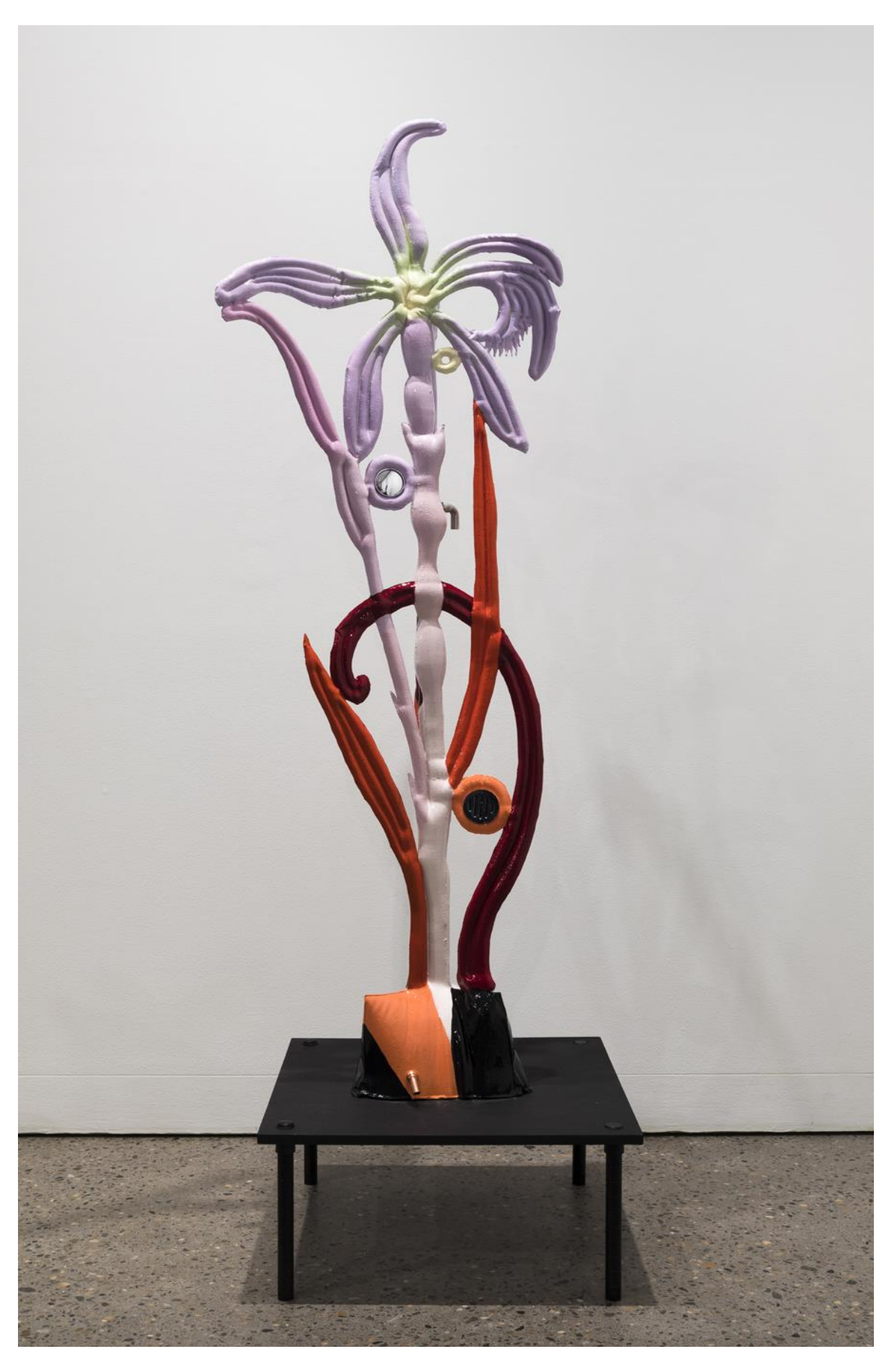
Caroline Rothwell Symbiosis (blue beard orchid), 2020/21, canvas, gypsum cement, aluminium, steel, paint, expoxy glass.